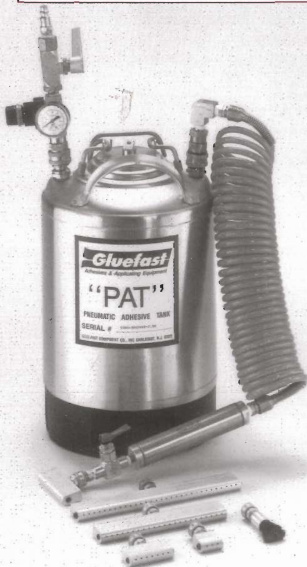
PAT shown with interchangeable glue heads